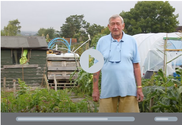
What impact has I Can had on your family and friends?

If you are viewing this candidate pack digitally, you should be able to click the videos below to play them directly on your device. If you are having any problems, or have printed this pack, then you can visit the I Can Move More YouTube channel by visiting https://www.youtube.com/@icanmovemore